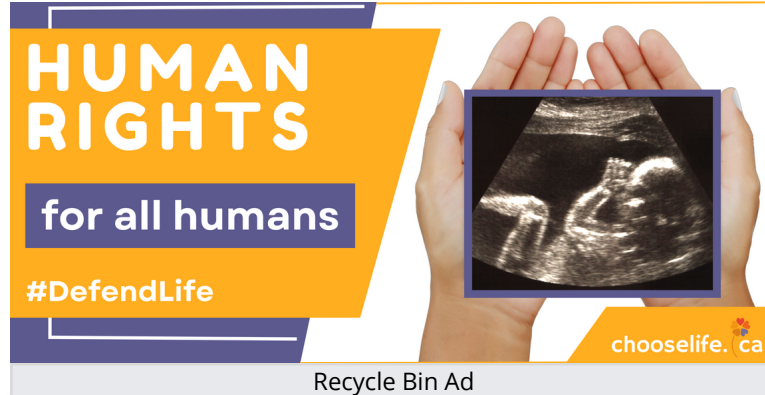
Recycle Bin Ad